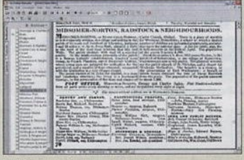
DIRECT: Navigate to the place of interest using the bookmarks

This is a directory-cum-guide, to Somerset's professions and trades, nobility, gentry, clergy, coach and carrier services, taverns and public houses.