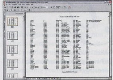
FIND IT: All text is fully searchable by Acrobat's Find command

If you have ancestors in St Just in Penwith, this is the CD for you. ■