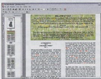
WILLIAM STOUT'S DIARY: Has all the charm of 18th century turn of phrase

1866; descriptions of the River Lune from 1801 to 1845; and a comparison of Lancaster in England and Lancaster in Pennsylvania in 1880. You get photographs of churches and chapels of the Lune Valley, and two slide shows – Sunderland Point and the Lune Valley from source to sea. ■